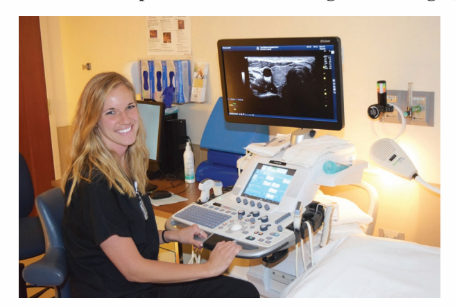
Remember, you have a personal choice of where you are tested and treated. Choose Quality Care, Close to Home.

For more information about our Diagnostic Imaging services, call 419.483.4040, Ext. 4234 or visit www.bellevuehospital.com/services/diagnostic-imaging.