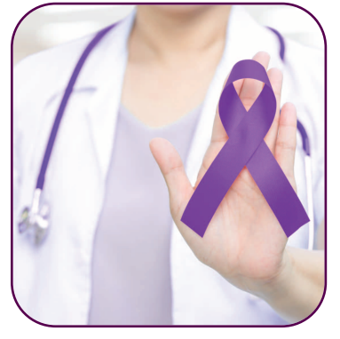
November is National Alzheimer's Awareness Month

1400 West Main Street P.O. Box 8004 Bellevue, Ohio 44811 419.483.4040